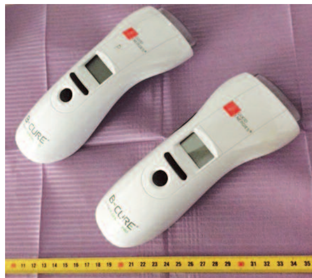
Figure 2: Devices used blindly by the patients: treatment device and placebo device.

In a recent study, Kobayashi et al 25 ) hypothesized that one of the pain relief mechanisms when